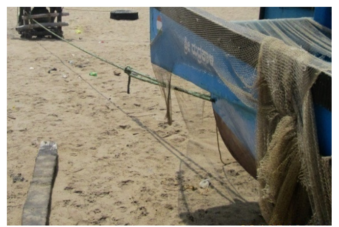
Figure-2: Towing rope attached to the stem of the fishing Boat.