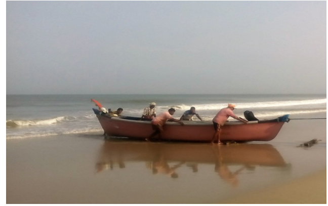
Figure-1: Fishing boat coming back from fishing.

Operation of winch: The operation of winch occurs only in beach landing centers, where there is no proper jetty to land the boat. When the fishing craft returns after fishing, the rope which is wound on the "Dhowr" winch is released and tied to the stern of the fishing boat (Figure-1 and 2). The craft is dragged to the beach by the winch with the keel sliding directly on the sand. But pulling the wooden boat directly on the sand can be very difficult as the keel of the wooden boat gets sink in the sand. Besides, the wooden boats are also likely to become abraded by being hauled over sand and stones. The required pulling power can be drastically reduced by using wooden plank between the keel of the craft and the sand. The handle or the lever of the winch which is parallel to the ground is rotated manually. The fishermen would co-ordinate their rhythmic movement by singing a preferred song as they move around the capstan holding the lever in clockwise direction (Figure-3). The towing rope which was connected to the boat is wound several turns around the central pivot until the craft is hauled upon the berthing area on the beach (Figure-4). After the boat is berthed properly, the nets are taken out to remove the catches (Figure-5). A single "Dhowr" is aligned to operate a minimum of three fishing crafts on the beach.