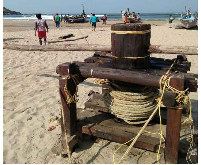
Figure-4: Fishing boat reaching the berthing area on the beach.