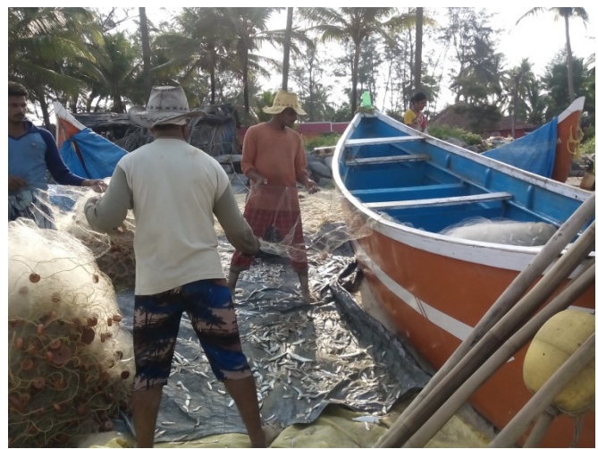
Figure-5: Fishermen removing the catch from the net after berthing the boat on the beach.